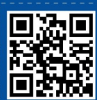
WUT Website 学校网站

网址/website: http://sie.whut.edu.cn/english http://admission.whut.edu.cn/