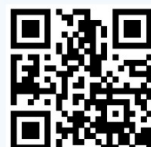
中文授课本科专业详见

英文授课本科专业：土木工程、工商管理、国际经济与贸易、计算机科学与技术、采矿工程、工业工程、机械工程、物流管理