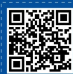
International Student Center 留学生教育管理中心